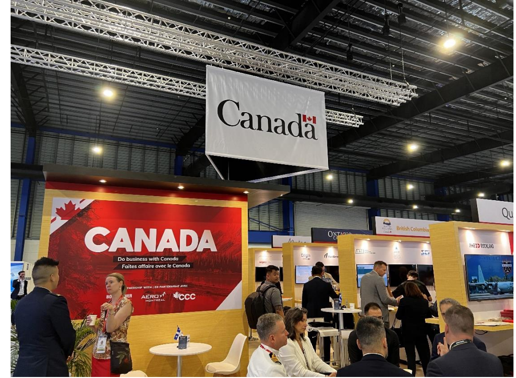
We extend our sincere gratitude to everyone who visited our booth, interacted with our team, and contributed to making the Singapore Airshow a memorable and successful event. Your enthusiasm and support inspire us to continue pushing boundaries and shaping the future of flight.

Moreover, participating in the Singapore Airshow allowed us to forge valuable partnerships and explore new opportunities for collaboration within the aviation industry. It was a testament to Murphy Aircraft's dedication to staying at the forefront of aviation technology and innovation.