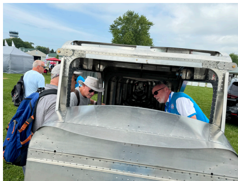
Inside our open fuselage mockup, visitors get hands-on with the structure—because we believe in transparency, literally.