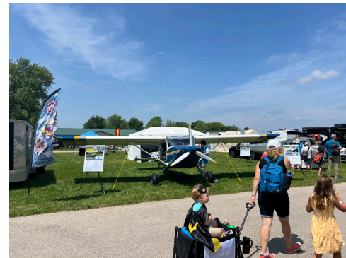
Murphy Rebel under the spotlight as families stroll past—look closely for the little superhero in the wagon!