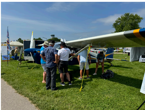
Crowds gather under the Rebel wing, deep in technical discussion about performance and build steps.

Builders and dreamers alike took a close-up look at our demo fuselage, where they could step inside and imagine their own Murphy kit coming to life. Questions about build time, component quality, and custom features sparked rich conversations with our team all week long.