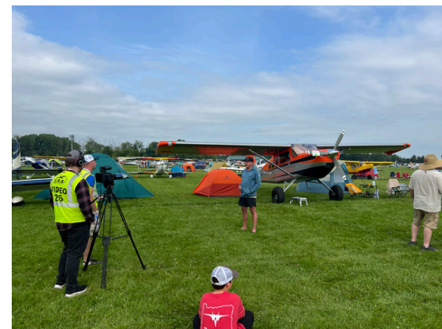
EAA video crews captured the stunning orange Murphy Moose.