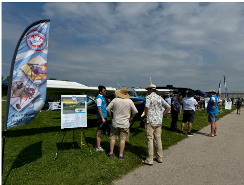
Our team and signage set up bright and early, ready to welcome visitors from all over the world.

This year, we proudly showcased our Murphy Moose, Rebel, and Radical Easy-build kit. With each aircraft representing the spirit of rugged Canadian design and builder-friendly engineering, our display drew a steady crowd of curious visitors, from first-time builders to seasoned pilots.