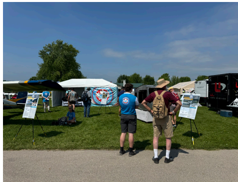
Veteran builders, first-time visitors, and our team members sharing stories and specs under the summer sun.